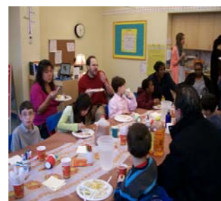
The Asteroids' Thanksgiving table.

Thanks to all the Asteroid parents and relatives who made this such a special and delicious day!