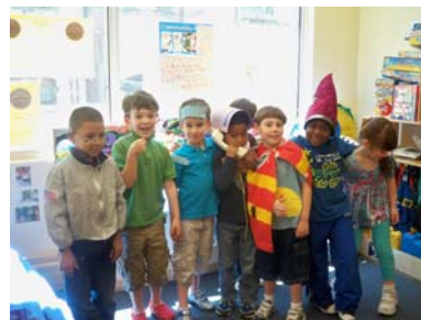
The Comets planned and presented their very own movie in costumes created especially for the movie.