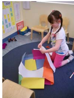
Lexi is building her own police car.