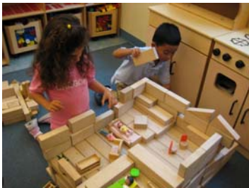
Jacob and Camille are working together to build an attic with blocks and dollhouse furniture.