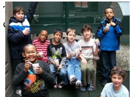
Some of the Galaxies celebrate on the GBS roof.

room. Once the class reached 100 Acts of Kindness, the class voted on a reward. It didn't take long for them to reach their goal! This time, they decided to celebrate with an ice cream party on the roof.