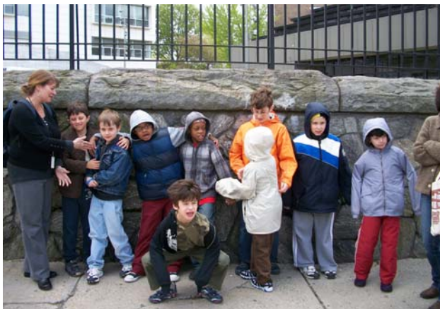
The Galaxies stand outside the Dance China performance.