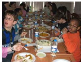
The Galaxies sample Indian food in Jackson Heights.

First, the Galaxies studied India. We took a field trip to the “Little India” neighborhood of Jackson Heights where we experienced some aspects of Indian