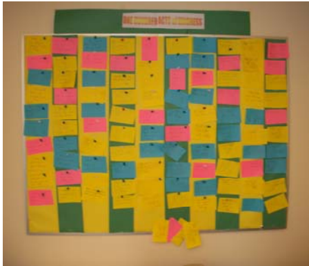
The Galaxies' "100 Acts of Kindness" wall, full of observations.