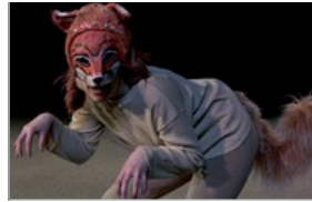
“The Fox” from Circle in the Square Theater’s performance of Aesop’s Fables.

characters in the book, while they watched the movie adaptation.