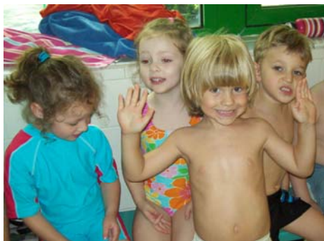
Moons at the Asphalt Green swimming pool.