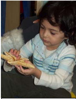
Discovering what a Star fish feels like was very exciting!