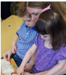
Creating special moments in our classroom, while sharing a story.