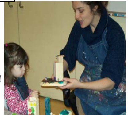
"Can you tell me about your model? What materials did you use?"