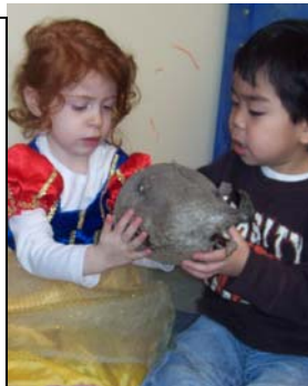
Yes, she really said, "This is a puffer fish!"

Spring is all around us and the Stars have noticed the new buds and blossoms. Inspired by nature, we have planted our first flower garden. We wait in anticipation!