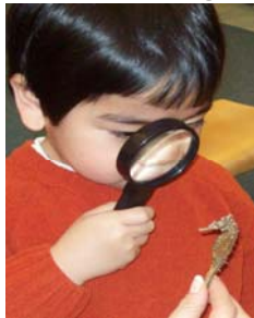
"Wow, a sea horse!"

SCIENCE Sea animals have captured the imagination of the Stars. We were able to explore a variety of sea creatures including a live hermit crab. Children want to learn through observation and investigation. They can share what they discover. Most importantly, it is active learning. Our goal is to foster scientific thinking.