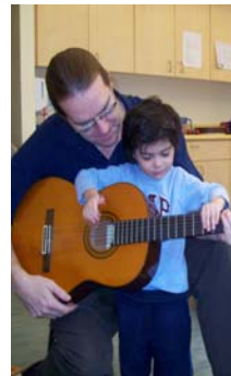
Hidden talents come out.