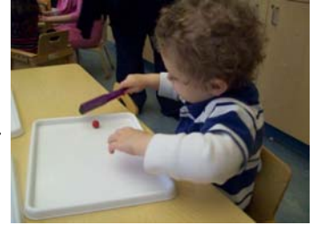
The Stars learned about cause and effect by manipulating marbles with magnets.

the same things that adults do. Cooking activities incorporate science, math, literacy, language, and the development of social skills. Children love to stir and pour the ingredients. Then, they get to smell, see, and taste the end product.