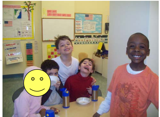
Supernovas making silly faces.

Plan-Do-Review: A time when students first express their choice of materials and create a plan for their play. Then students have the opportunity to execute their plan, often using problem solving skills as they create. Students also relate to other children in their play, helping to develop social skills. At the end of Plan-Do-Review students recall their ideas and use language skills to describe what their ideas and actions accomplished.