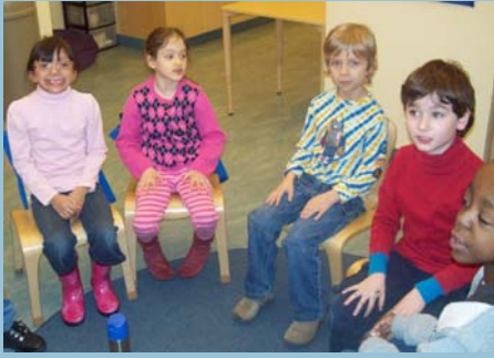
Supernovas doing whole body listening