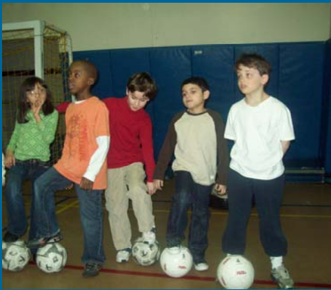
Supernovas using foot stops.

Supernovas are improving their listening skills during lessons. Whole Body Listening is a curriculum that teaches kids that we listen using our whole body. Not only do our ears have to be listening, but our mouths have to be quiet, our eyes have to be looking at the teacher, our hands have to be in our laps, our feet are on the floor, our backs are against the chair and our brains are focused. After breaking down and teaching all the steps required for listening, teachers have seen a great improvement in the Supernovas' focus and attention during lessons.