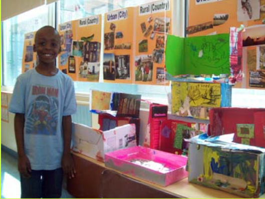
Langston with urban apartment designs by the Supernovas.