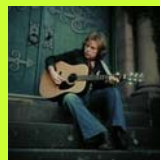
Van Morrison: Brown Eyed Girl