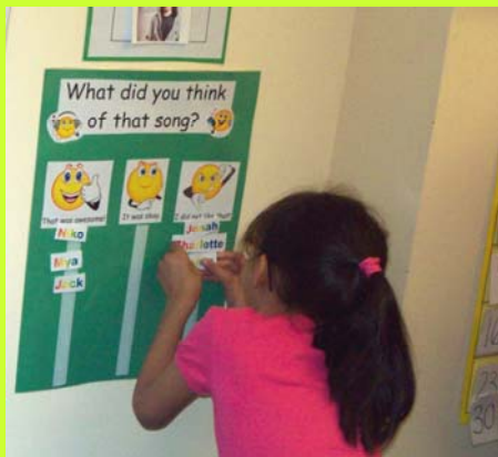
Taina shares her opinion of a song.

After studying city life, we began to investigate rural communities. We learned that rural places are much different than cities. They do not have as many people, cars, or buildings, which means that there is much less traffic and noise. Rural communities also have many farms, trees, grass, and flowers. Using their knowledge of rural communities, Don and the Supernovas made a model of a rural community, which included a pond, house, farm, garden, trees, grass, and animals.