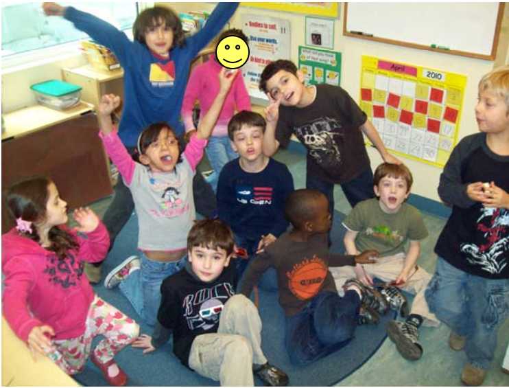
Hooray for the Supernovas!