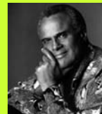
Harry Belafonte: Jump in the Line