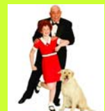
Annie Soundtrack: It's a Hard Knock Life