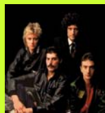
Queen: We Will Rock You