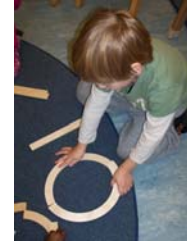
Harry makes Mat Man’s head from two big curves.

interesting to compare pictures of figures they have drawn before learning about Mat Man and pictures afterward. After practicing Mat Man, many of the children improve spatial awareness and organization of body parts.