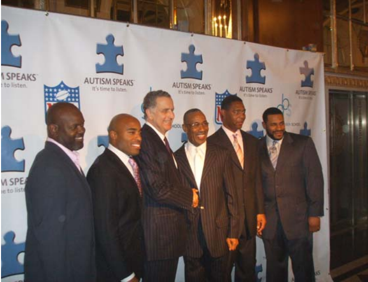
GBS joins forces with the NFL & Autism Speaks. See story on page 2.