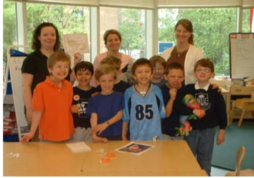
The Ice Creams

The Ice Creams spent an exciting year full of projects and hands-on learning that has enlarged and deepened our understanding of the world and how our actions make a difference. We are especially proud to