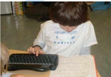
AlphaSmarts keyboards & new software for keyboarding...

Generous support from GBS families and friends has allowed us to purchase or install the following: