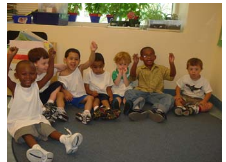
The Yellow Room

It has been an exciting and fulfilling year in the Yellow Room! For many of us, it was our first school experience; together we built a community and enjoyed developing friendships, growing with and learning from each other. We became active explorers of the interesting things in our school, neighborhood and world. Some of our social studies included taking a look at buildings and vehicles in our city, as well as learning about ourselves as babies and how we have grown. Our science investigations included looking at the weather, colors, size, plants and changing properties of materials such as ice, water and food. Our unit on "Eating the Alphabet: Fruits and Vegetables from A to Z" led us through a close study of the alphabet, phonemic awareness, as well as challenged us to explore new foods using all of our senses. We took risks and tried new things with encouragement of our peers. And most importantly, we laughed a lot!