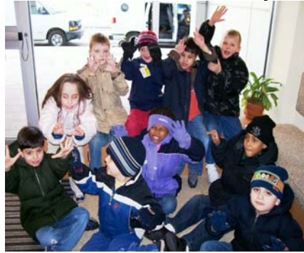
The Spiders getting ready for a trip

The Spiders have been working very hard all year having fun and learning lots of new things about our world. We have explored all the various climates