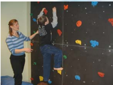
Rock Wall and hooks for the OT sensory gym...