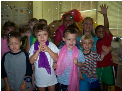
The Blue Room in an ocean of bubbles