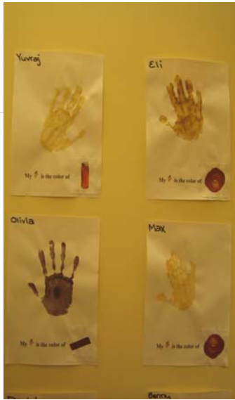
Colors of Us

It was amazing to watch the Sunflowers bloom as the school year progressed. The children began with an All About Me Unit which incorporated numerous art projects, movement activities, and read-alouds to explore each person's unique characteristics while discussing similarities and differences in the classroom. One of the favorite lessons