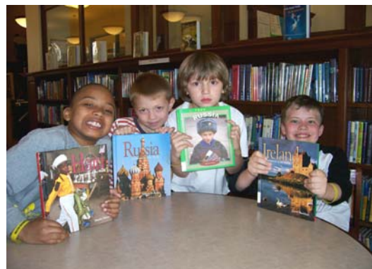
The Rockets at the Library showing off books on their families home country

The Rocket's worked hard to strengthen their writing and creativity through use of the writing process. This included using semantic maps to organize thoughts, creating a rough draft, editing and revising and then publishing their work by typing on the computer and creating illustrations. Toward the end of the year the Rocket's became more independent with this process. The Rocket's also worked hard on understanding the importance of character development. We discussed such traits as respect, trust, citizenship, caring and fairness. The Rockets read books, role-played and were involved in many hands on activities that helped them to understand and demonstrate these character traits. During our unit on citizenship, the Rockets had a read-a-thon to raise money for the Tropical Rainforest. The Rocket's were also interested in learning about immigration and when their own families came to the United States. This interest sparked a project in which each child researched a country that their family was from. Each child culminated their research into a poster about their country. We then held a World's Fair, where each child displayed their poster and even shared food they had made that originated in those countries. It was a spectacular project to end our year!