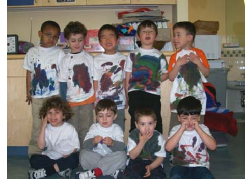
Red Room boys in their self made tee-shirts

It has been a productive and exciting year in The Red Room. The boys have come together to create a strong, caring community. Each morning they delight in seeing one another and telling each other about their latest news. Throughout the year the boys initiated units about fire trucks, woodworking, snow, planting and weather. Within each of these entities, they have become experts, sharing their knowledge with one another and with others throughout the Gillen Brewer community.