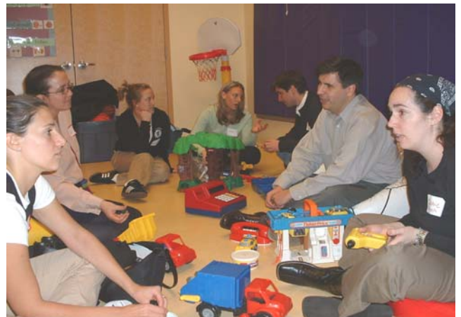
GBS Parents in one of our many parent workshops