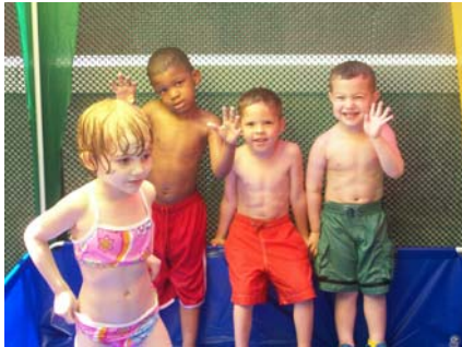
The Blue Room in the sprinkler

The Blue Room has much to be proud of. Over the course of the school year, the children have grown into a