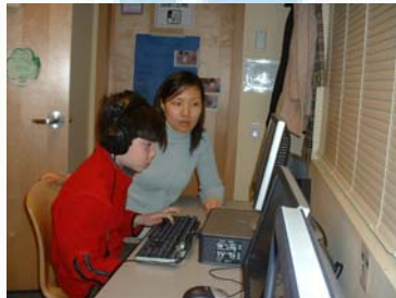
Assistive technology and Software for our web site...