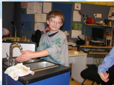
...and A portable sink for the Art/Music Room