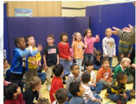
GBS children recording our school song

You can own your own copy of the Gillen Brewer DVD, featuring the professional recording of our school song for only $20.00. The DVD features great footage of the children in their daily life at GBS, all set to our school song. Call 212-831-3667 to purchase.