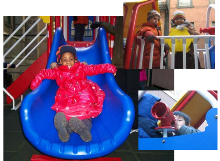
New playground equipment on the roof