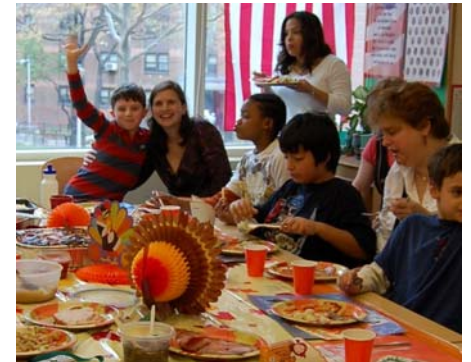
Lots of delicious food and drink was shared at the Hawks table