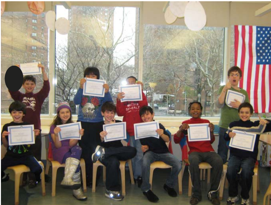
The Hawks proudly display their certificates for their hard work