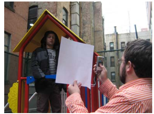
Braque films John's morning announcement segment