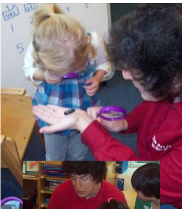
Science partnership with Art Farm