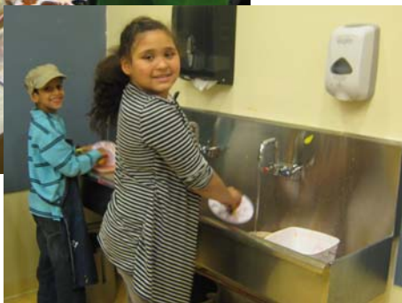
New, permanent, three-faucet sink in the art room