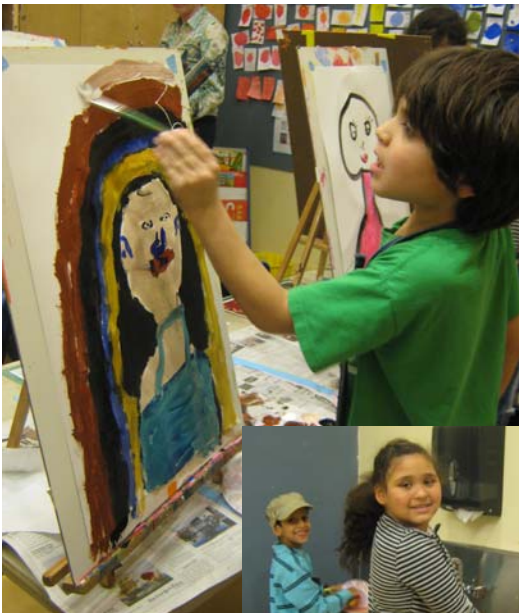
Art materials and supplies