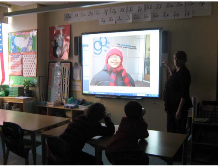
Smartboards in classrooms