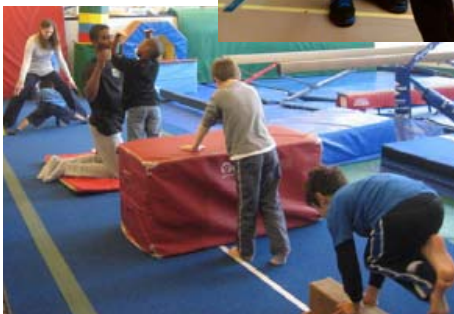
Sports program at Asphalt Green