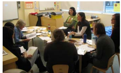
Professional development for teachers