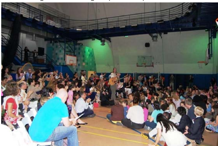
The Gillen Brewer community singing and signing together

Family members gathered at Asphalt Green on June 19, 2009 to celebrate students' achievements during the 2008-2009 school year. Each student received a medal with a personal accomplishment written on it. Each class was recognized for a group accomplishment achieved this year.