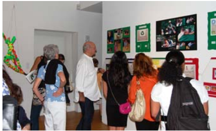
Guests enjoy the good company

On August 4th, over 150 parents, students and friends gathered at the Danese Gallery in Chelsea for our summer art exhibit, a collaboration of summer work in art and science.