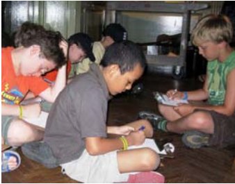
Anacondas take notes at the Museum of the City of New York