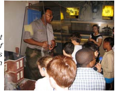
Praying Mantises at Federal Hall, the site of George Washington's inauguration