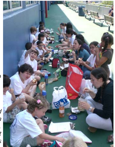
Alligators and Grapes on a joint field trip, share lunch at Chelsea Piers

The Grapes had an action-packed summer! In Social Studies, we learned about how people lived in the past. It was interesting to see the different toys kids would play with and the clothing they would wear! As a class, we read a chapter book called My Father's Dragon . We followed the main character, Elmer, on his journey to rescue a captured dragon! Along the way, the Grapes learned many new vocabulary words. When the Grapes were not hard at work doing academics, we were busy swimming, playing at the park and going on field trips. On Thursdays, the Grapes improved their swim skills at Asphalt Green. We also had the chance to explore two different parks this summer, Asphalt Green and Carl Schurz. It was so much fun playing in the sprinklers and eating ice pops with our GB peers, the Alligators! Field trips included an exploration of the Bronx Zoo and bowling. At the Bronx Zoo, we were so excited when a peacock walked right up to us and fanned his beautiful tail feathers! While bowling at Chelsea Piers, we cheered each other on and practiced our math skills by adding up points. The summer program gave us many opportunities to generalize the academic and social skills that we acquired throughout the year. Over the past 12 months, our classroom has been transformed into a caring community. It has been a true pleasure growing and learning!