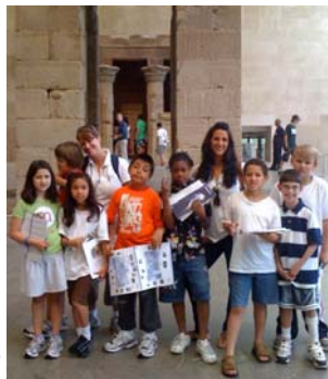
Dollars at the Metropolitan Museum

The Dollars completed a social studies unit on ancient Egypt, which focused on four aspects of ancient Egyptian life—the Nile River, mummies, hieroglyphs and pyramids. Each mini-unit featured a hands-on element, such as making canopic jars and amulets for a model-magic Pharaoh mummy, drawing a sequential comic strip showing how to build a pyramid and planting seeds in sand and soil to illustrate the life-giving properties of the annual Nile River flood. We took a trip to the Metropolitan Museum of Art to see the Egypt exhibit. Our shared reading was the classic story, The Boxcar Children , by Gertrude Warner. We explored plot and character development, learned new vocabulary and Don Pearlstein, our volunteer, helped the students create a model of the boxcar home. The Dollars wrote short, character-based stories, as well as keeping up with our journal entries. We have also learned all the lower-case cursive letters, and practiced forming words and sentences. We enjoyed playing kickball and cooking each week with the Anacondas, and our final field trip together: bowling!