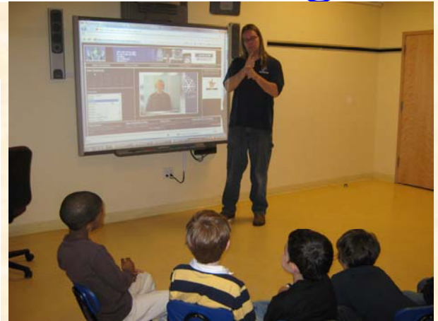
The Alligators learn sign language from an online dictionary.