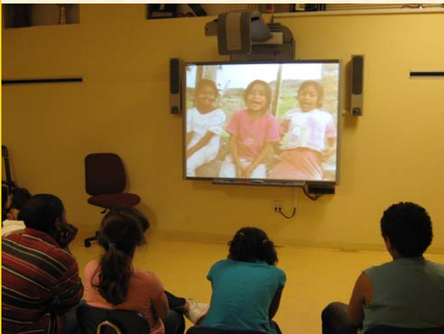
Listening to 3 Honduran girls sing their national anthem.

The "Smart Board" is often incorporated into a typical music lesson. It helps to visually identify and represent the elements of music. Words can be highlighted and videos containing songs and native instruments can be shown. While learning to sing new songs, numbers, pictures, and words supported by the lyrics can be drawn. Children are often given turns to draw their own ideas, which can motivate them to stay focused and on task.