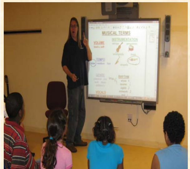
Identifying the elements of music in each song such as tempo, volume, genre, instrumentation, etc.