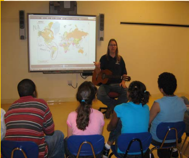
The Dragons reference a world map to locate Latin America